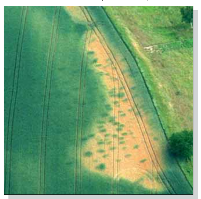
Figure 5: Radim 2 (distr. Kolín). Regular setting of maculae features of similar form, size and orientation indicates the existence of a cemetery site