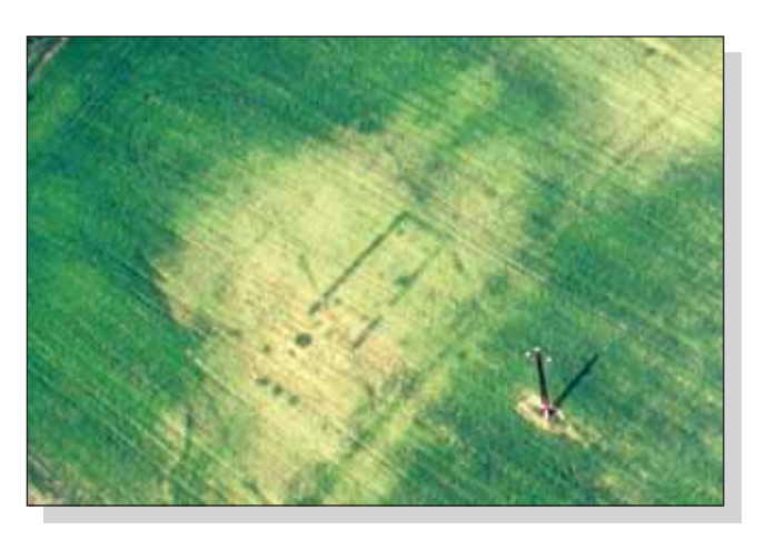
\begin{tabular}{ll} \textbf{Figure 7:} & Maculae - post pits - as part of the plan of an above-ground long early Neolithic house \\ \end{tabular}

It has become ever more necessary to create a specific system for the description of settlement areas (or their parts) captured on aerial photographs through crop marks. A system for the description of such areas (traditionally termed sites) is proposed using the parameters listed in table 1.