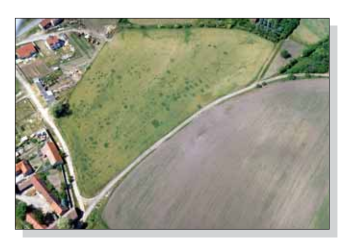
Figure 2: Ledčice 2 (distr. Mělník). Large concentration of maculae crop marks