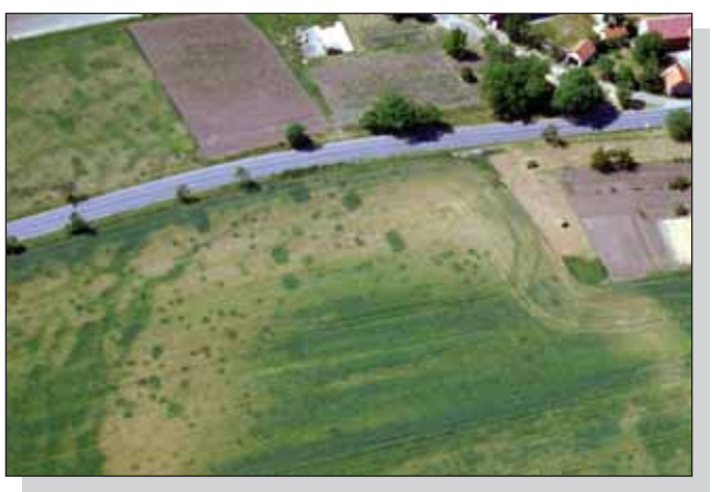
Figure 6: Ctiněves 2 (distr. Litoměřice). Regular spatial distribution of large macula features - sunken-floored houses (placed in the cluster of pits) indicates their contemporaneity

M.1.1), dwellings (fig. 1a: M.1.2.1, M.1.2.2; fig. 4) or graves. Numerous, variously extensive lines of rectangular maculae of the same size and orientation, mutually respecting one another and showing evidence of functional and temporal concordance are easily interpretable – these are regular cemeteries, for which it is possible to state a likely age due to prior knowledge of burial practices of particular prehistoric cultures (size of cemetery, grave orientation, clustering of burials in groups, etc., fig. 5).