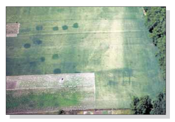
Figure 4: Horní Počaply 1 (distr. Mělník). A group of crop marked sunken-floored houses (Grubenhäuser)